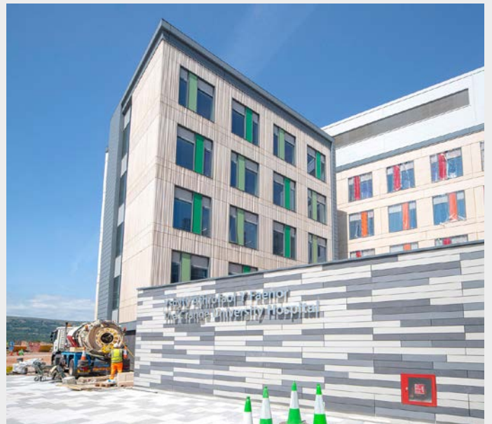
Grange University Hospital, Wales, UK